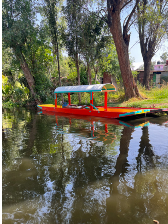
Xochimilco, Mexico City.