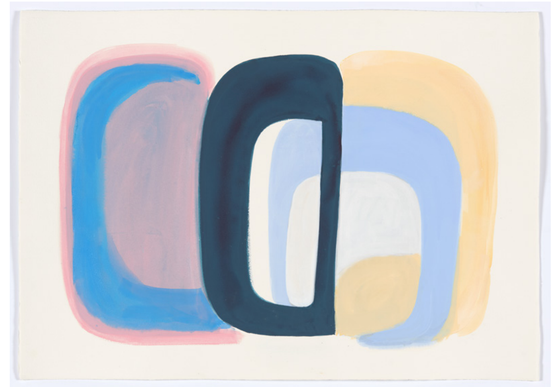
Mexican Suite #1, 2023 acrylic and watercolor on Arches paper 29 1/2 x 41 3/8 inches